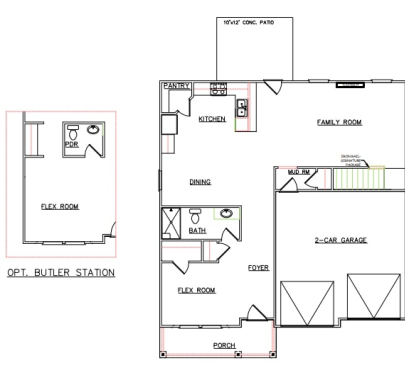
FIRST FLOOR PLAN (SCALE 1/8" = 1'-0")