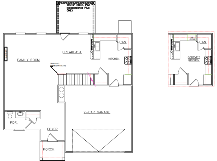
FIRST FLOOR FE