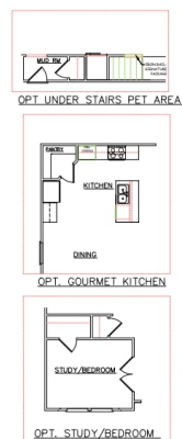
1ST FLOOR FE